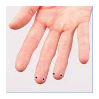
Take the sample from a warm or warmed up hand. The sampling sites are the sides of the middle finger and the ring finger.