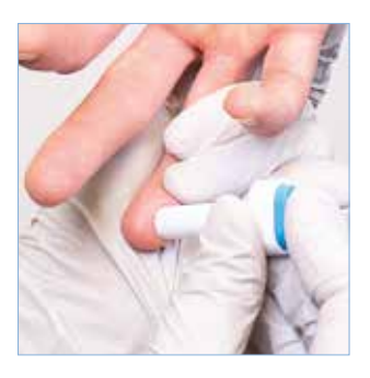
Place the lancet firmly against the skin and puncture the skin using a lancet of suitable size. Release the squeeze.